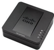
Cisco Fax Adapter